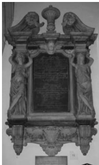
The Coventry Memorial