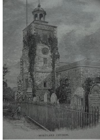
The church with the Beachcroft Nave. Note the ivy to the tower which first appeared around 1860 and was not removed until 1930

The existing Nave and South Aisle were completely reconstructed in 1905/6 by Sir Arthur Blomfield in the early English style, which gives the building it's simple, austere yet noble quality.