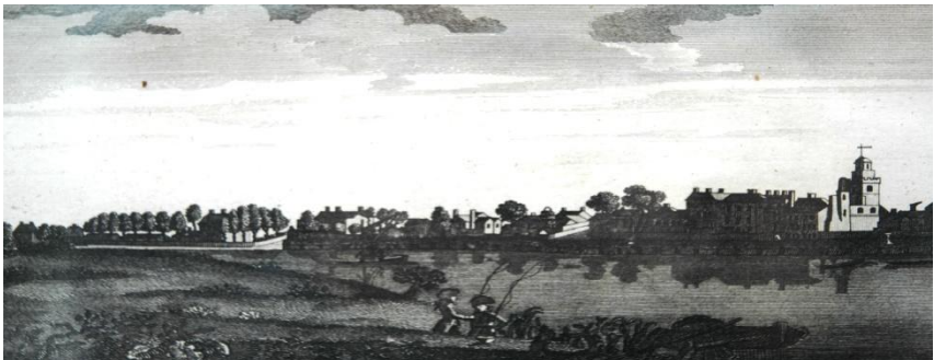
View of Mortlake from the River Thames c 1770

The belfry and the cupola are a distinctive feature of the tower which appears as a landmark in many historic prints and pictures of the Thames bank.