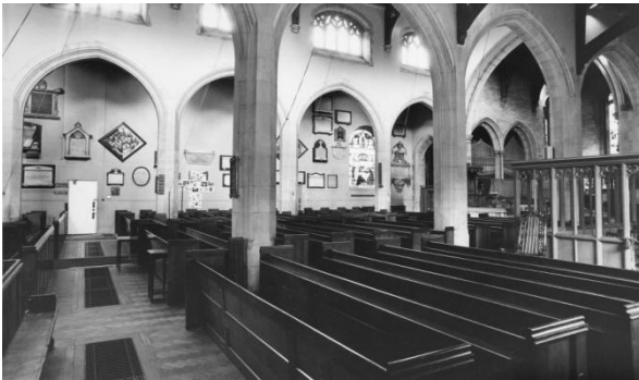
View of the Nave and North Aisle in 1978 before major alterations were carried out. Note the Lady Chapel to the side of the picture which was erected in 1936

In 1979-80 moveable oak pews were installed with a Nave altar, to create greater flexibility within the building. Memorials were imaginatively re-sited in their present position.